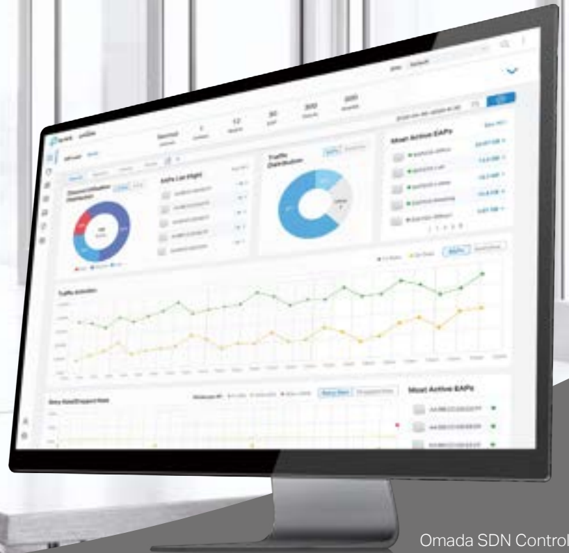
Omada SDN Controller